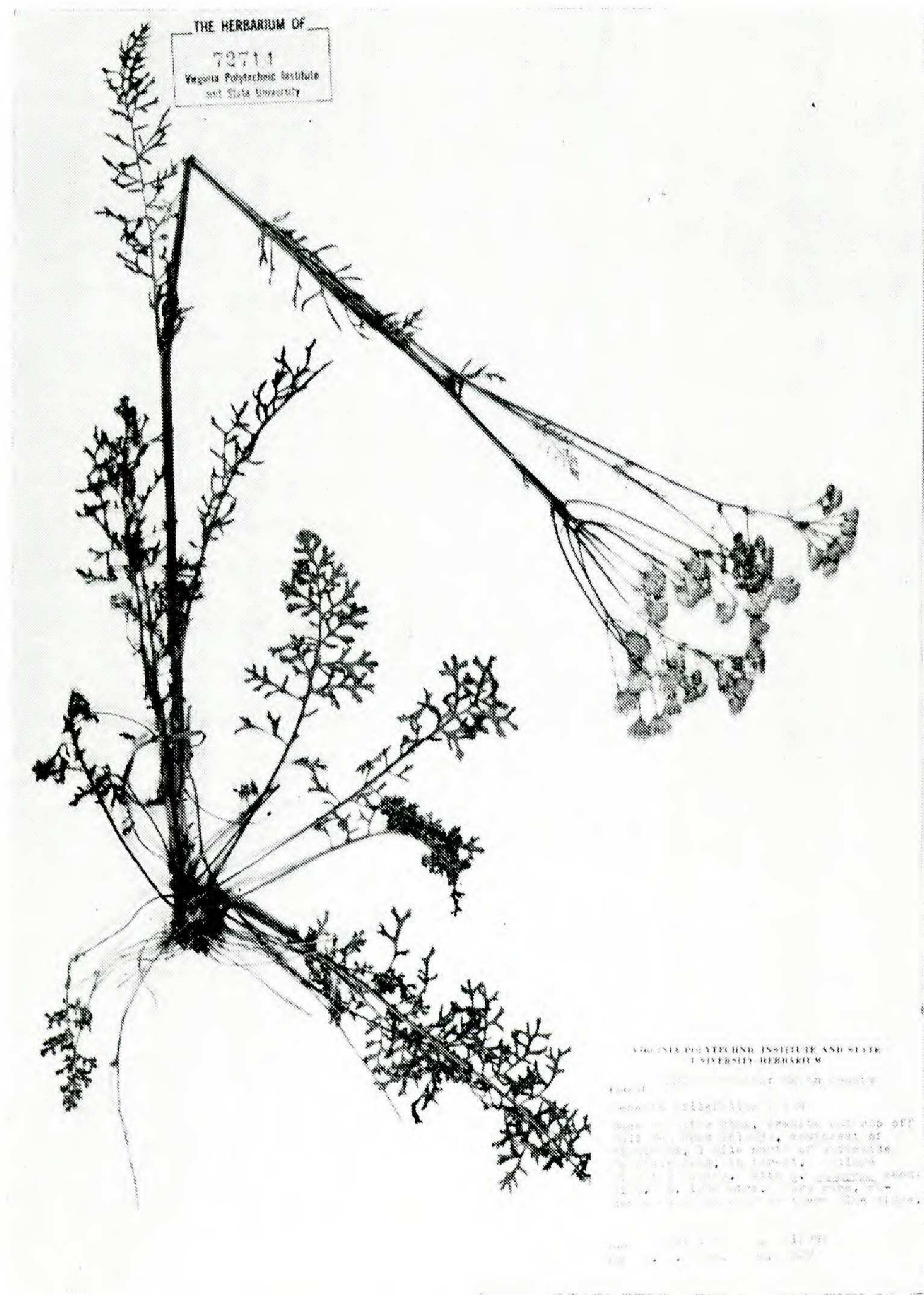
Figure 1. Senecio millefolium (Uttal 12992, VPI).